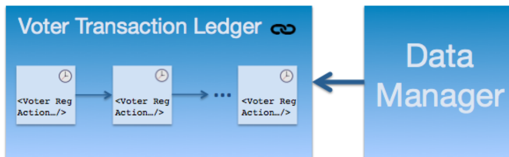
Figure 2. Vanadium Data Manager Controls Appends to the Ledger

Whereas current systems rely on DBMS capabilities for reporting, in the future Vanadium will provide a capability to replay the entire ledger into a transient DBMS that can be used for query-based processing.